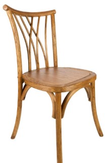
New! Willow Chestnut Chair